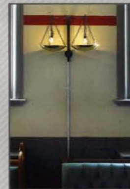
- Jamie's Italian, Cheltenham - including the 'scales of justice' light fitting