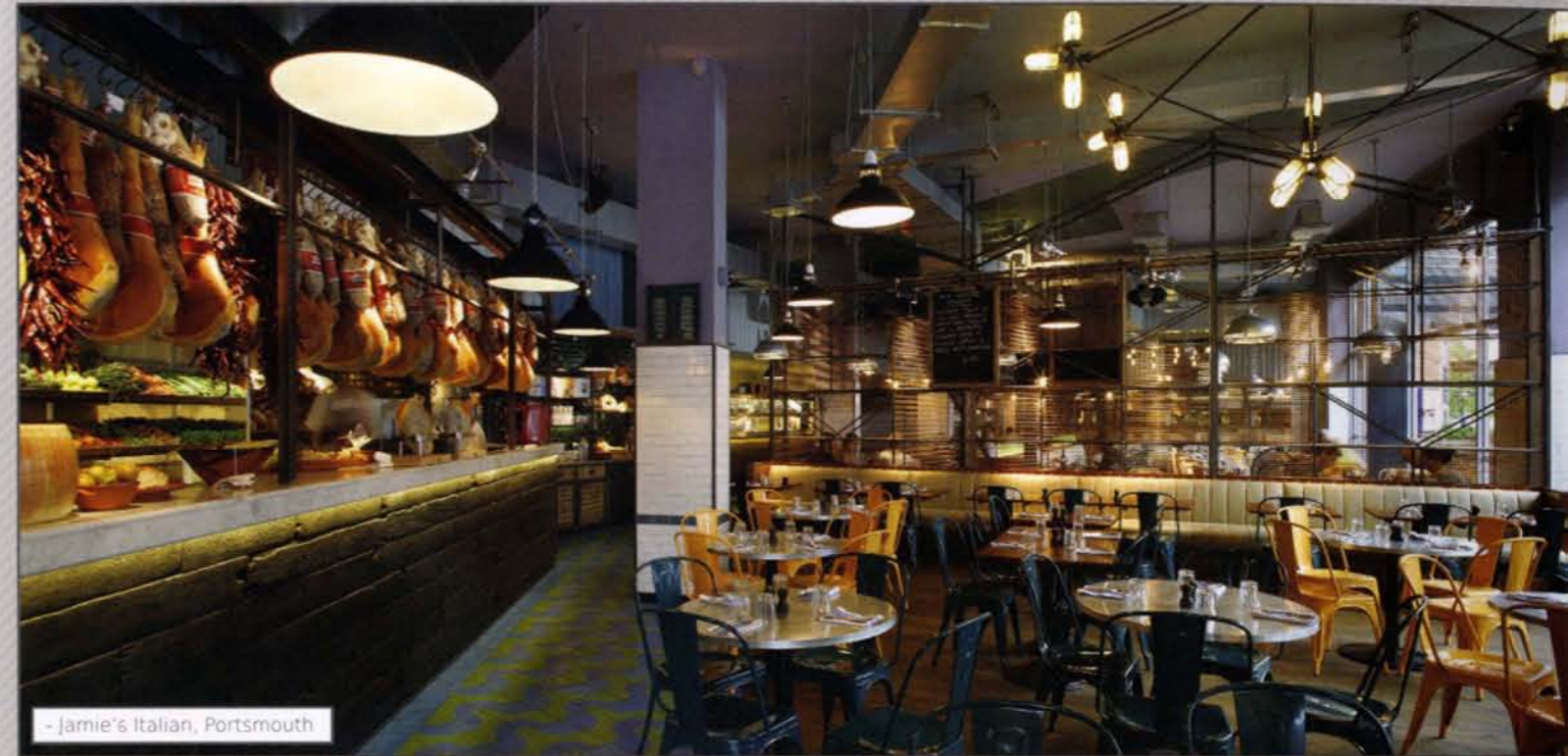
- Jamie's Italian, Portsmouth

Stiff + Trevillion Architects 16 Woodfield Road, London, W9 2BE T: 020 8960 5550 E: mail@stiffandtrevillion.com W: www.stiffandtrevillion.com