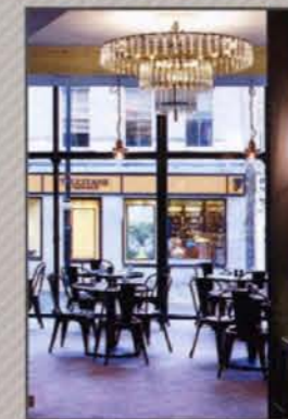
- Jamie's Italian, Bristol - including 'test tube' light fittings